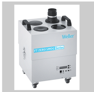
Solder fume extractors