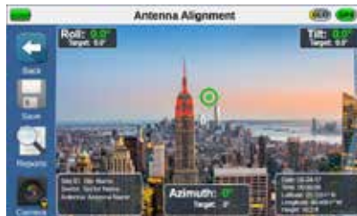
With Camera License