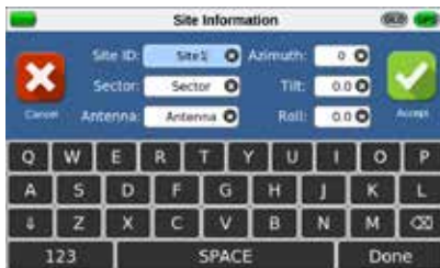
Data Entry Screen