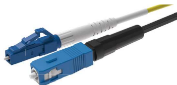
Fusion Splice-On Connector(FSOC)