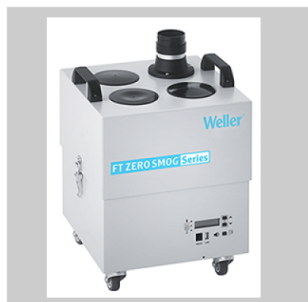
Solder fume extractors